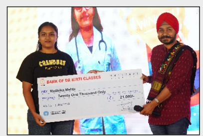
RADHIKA PARUL UNIVERSITY