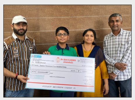
(STD: 6, RANK: 2)