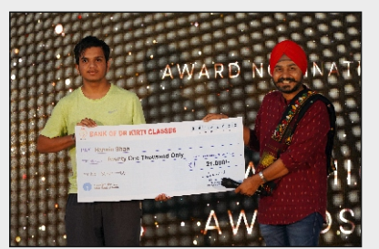
HANSIN IIT GANDHINAGAR